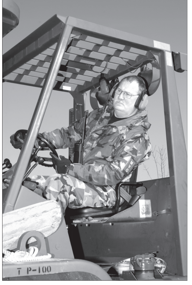
Members of the 123rd Aerial Port Squadron marshal cargo for simulated deployment during the February and May UTAs.